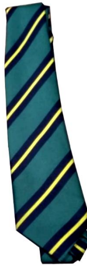
E. Rowlands (Green)