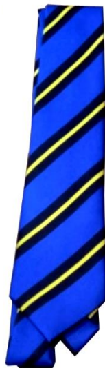
J.H. Lorrain (Blue)