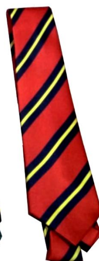
F.W. Savidge (Red)