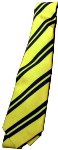
D.E. Jones (Yellow)